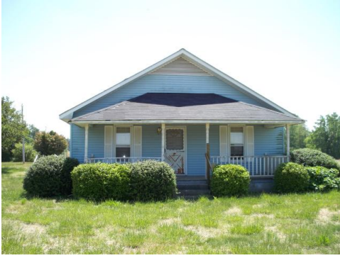
1. Front Elevation