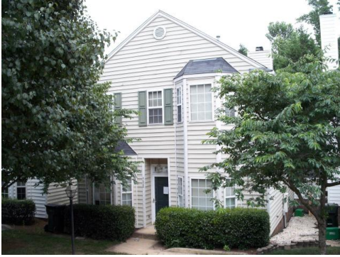
1. Front Elevation