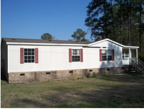
1. Front Elevation