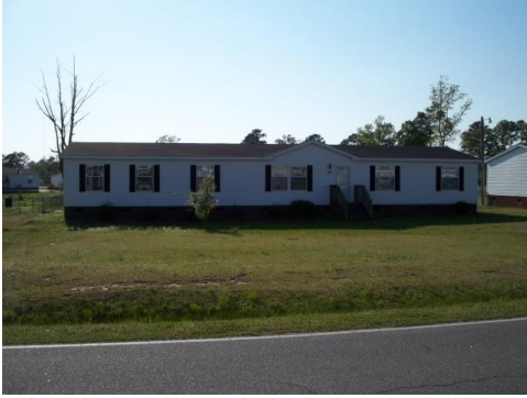
1. Front Elevation