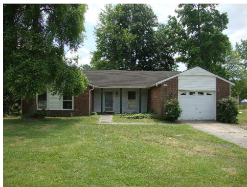
1. Front Elevation