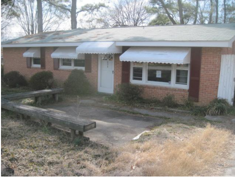
1. Front Elevation